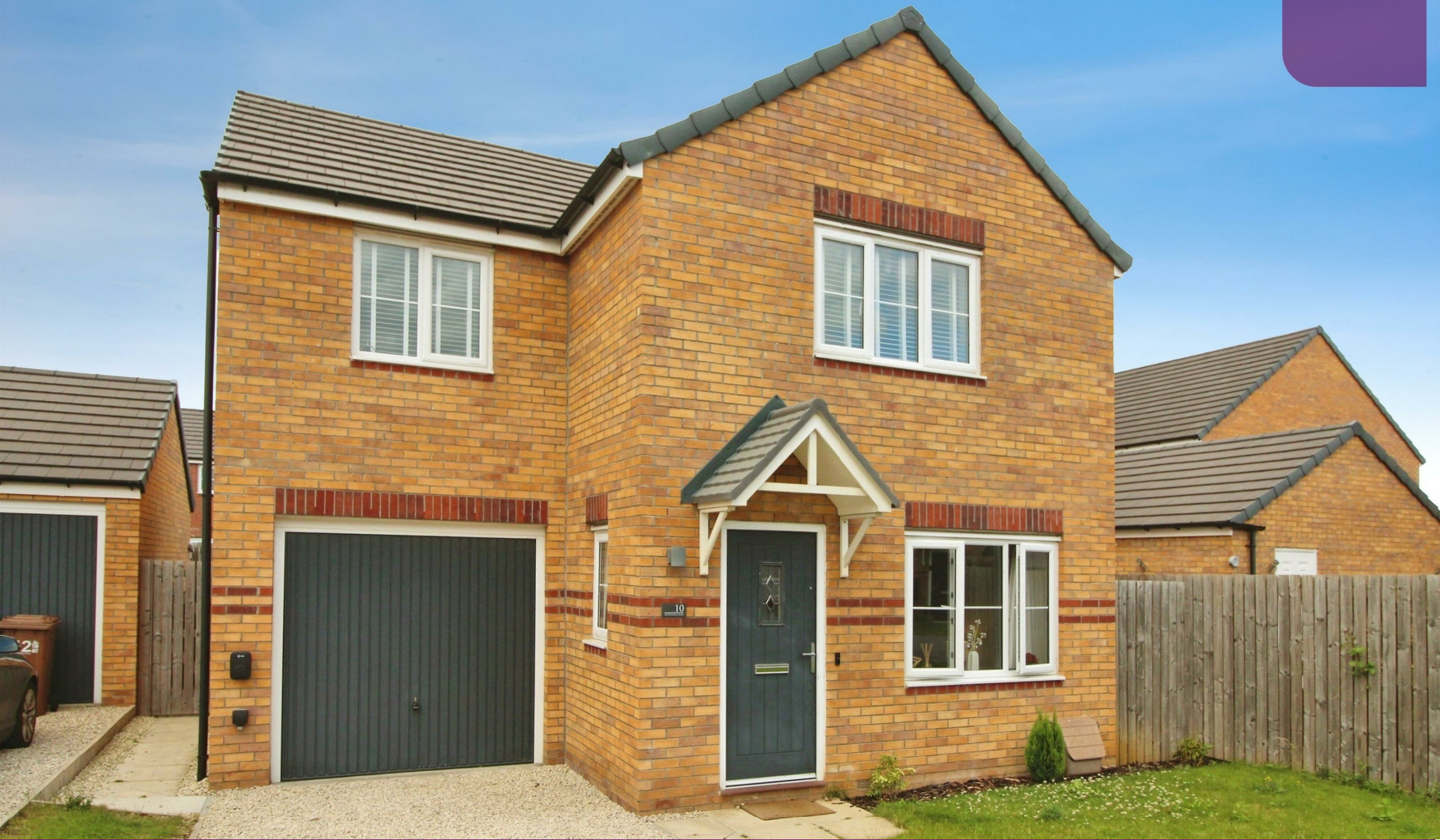
10 Poppyfield Way, Winterton, Scunthorpe, DN15 9FJ £205,000